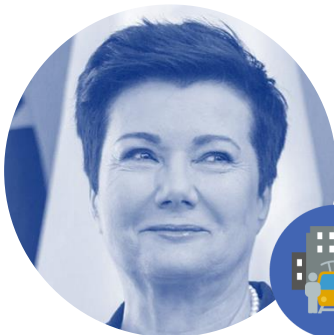
Hanna Gronkiewicz- Waltz